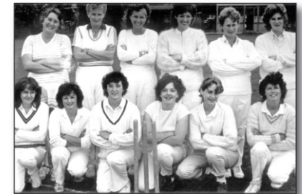
Right: North Tawton Ladies Cricket XI at Hatherleigh, c. 1980.